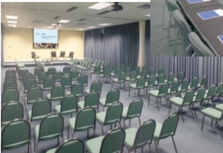
Sandyford Suites 1 and 2