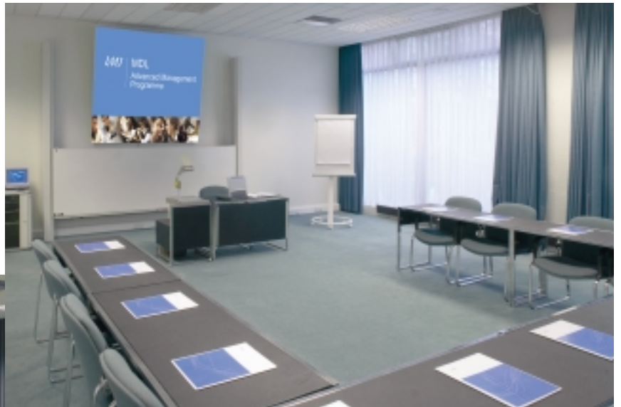
The Boyne Suite